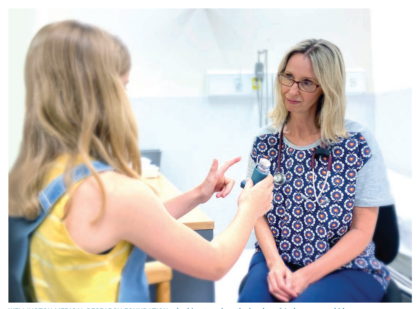
WELLINGTON MEDICAL RESEARCH FOUNDATION - looking to reduce the burden of Asthma on our kids

Talk to us today, about how you can start a meaningful philanthropic journey during your lifetime, or include charitable wishes in your Will. You can make a difference, and together, we'll create change.