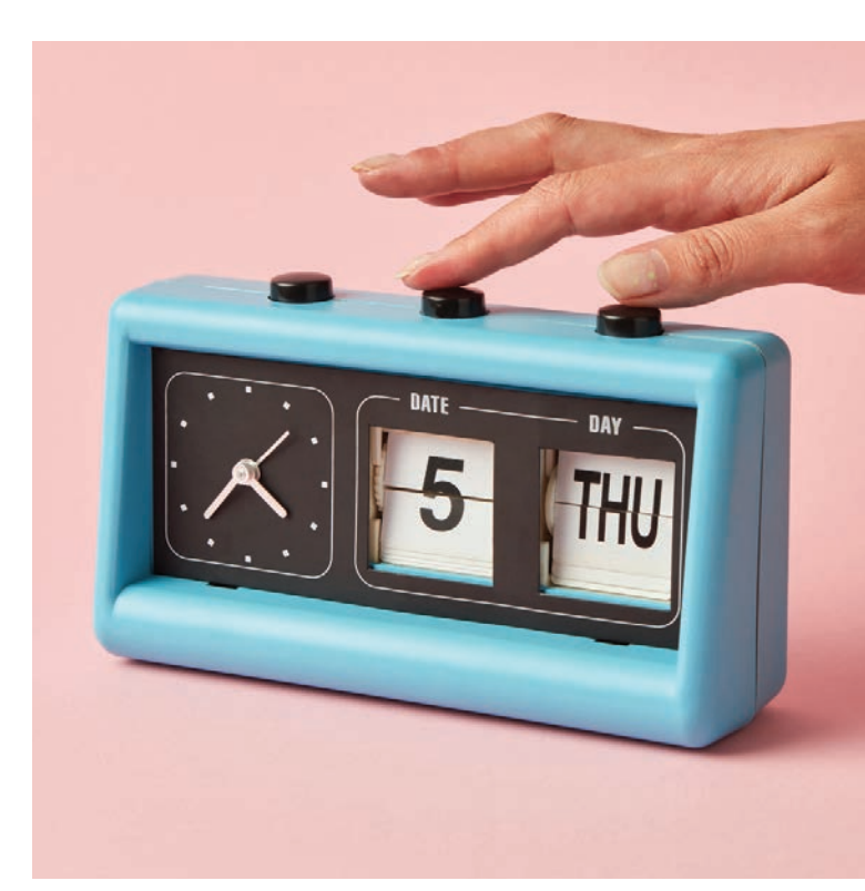
4 DAY WEEK - taking pause for employee wellbeing

As we commence this new decade I am excited about the possibilities to come, I hope you are too.